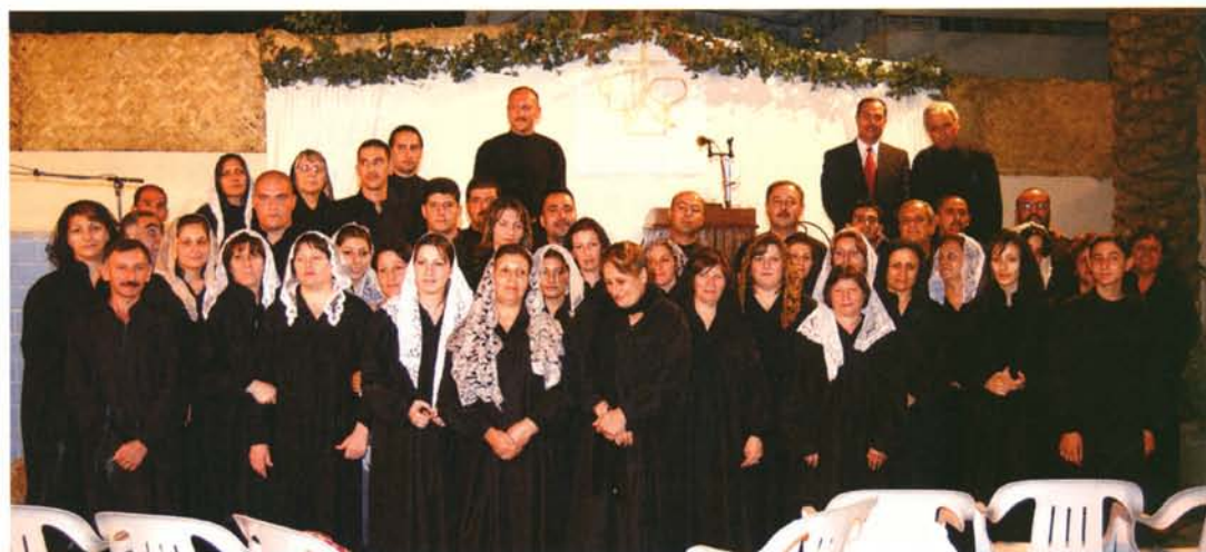
Baptismal candidates formed a unique praise and worship group for the outdoor service.